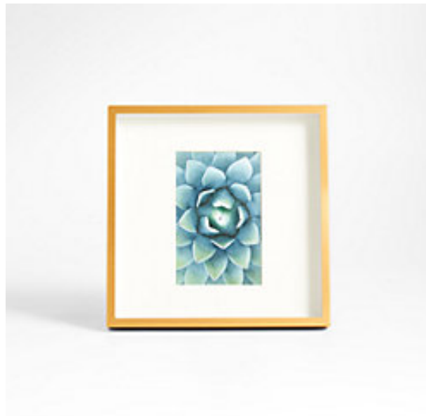
Brushed Brass 4x6 Picture Frame $24.95