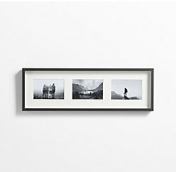
Brushed Black Triple 4x6 Picture Frame $44.95