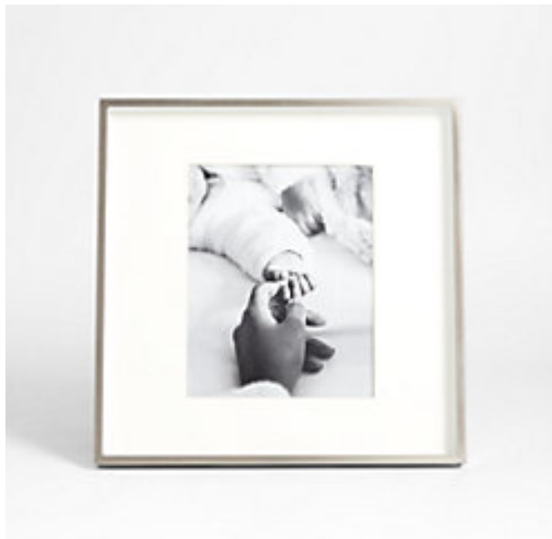
Brushed Silver 8x10 Picture Frame $49.95