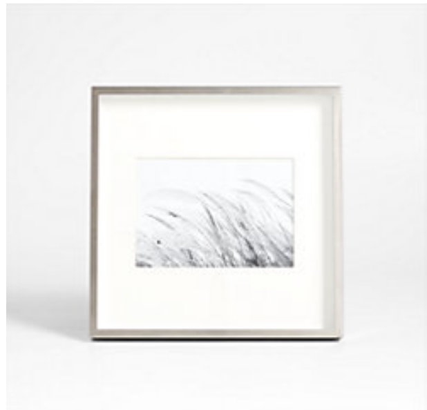
Brushed Silver 5x7 Picture Frame $29.95